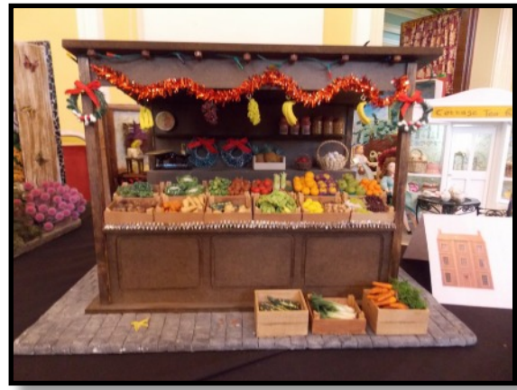
Just some of our work on display at the Sutton Coldfield Dolls House Fair on December 8 th.